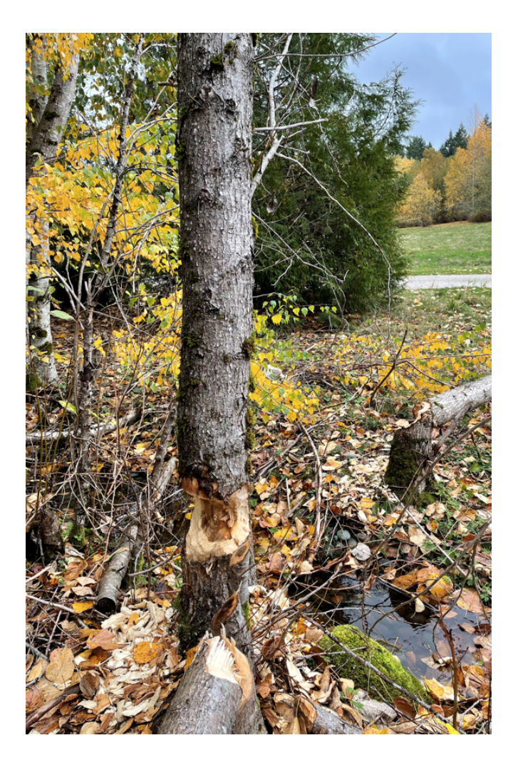
City Survey for Green Timbers District, as part of City Centre Plan Update