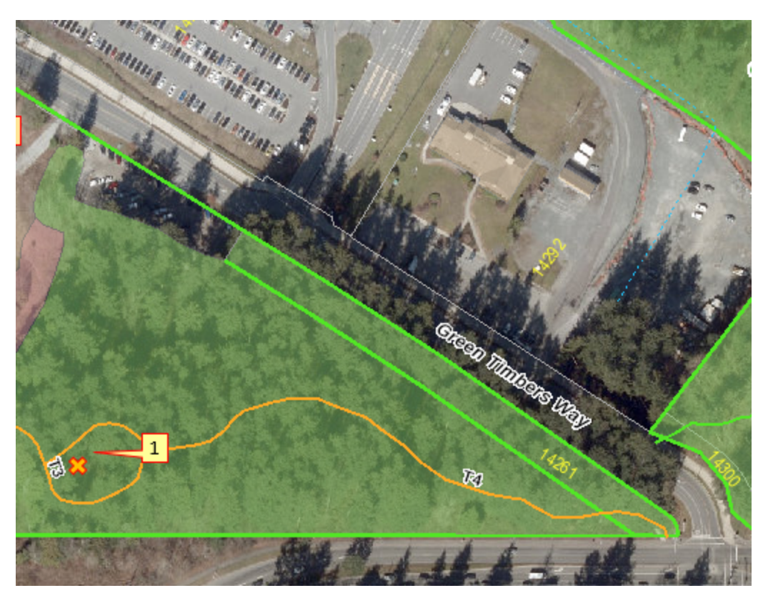
Location of tree

The tree unfortunately has significant internal decay (Phaelous schweinitzii – a common fungus found in Douglas-fir trees that causes severe decay of tree roots and buttress) at the base of the tree. The tree has been assessed by staff who are certified tree risk assessors and involved drilling into the tree with a resistograph drill to determine the extent of the decay. The tree meets the City's risk threshold for removal due to the severity of the decay and the risk of failing onto people using the adjacent trails.