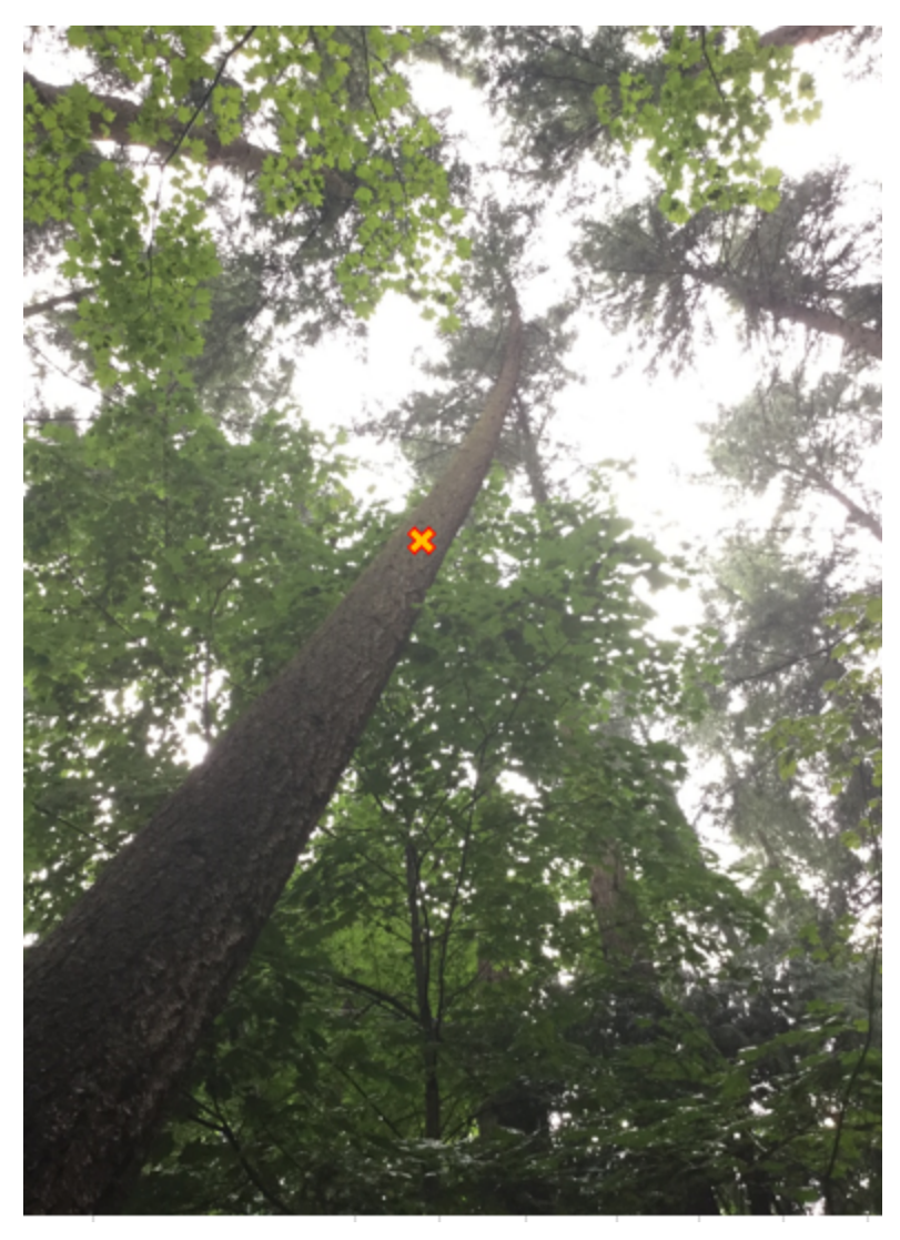
Tree to be removed